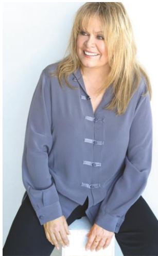
Sally Struthers plays “Mrs. Peacock”